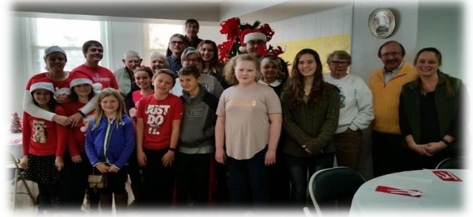
Many thanks to the volunteers from our church who helped the Pulaski soup kitchen serve a festive Christmas meal again this year. Here they are!